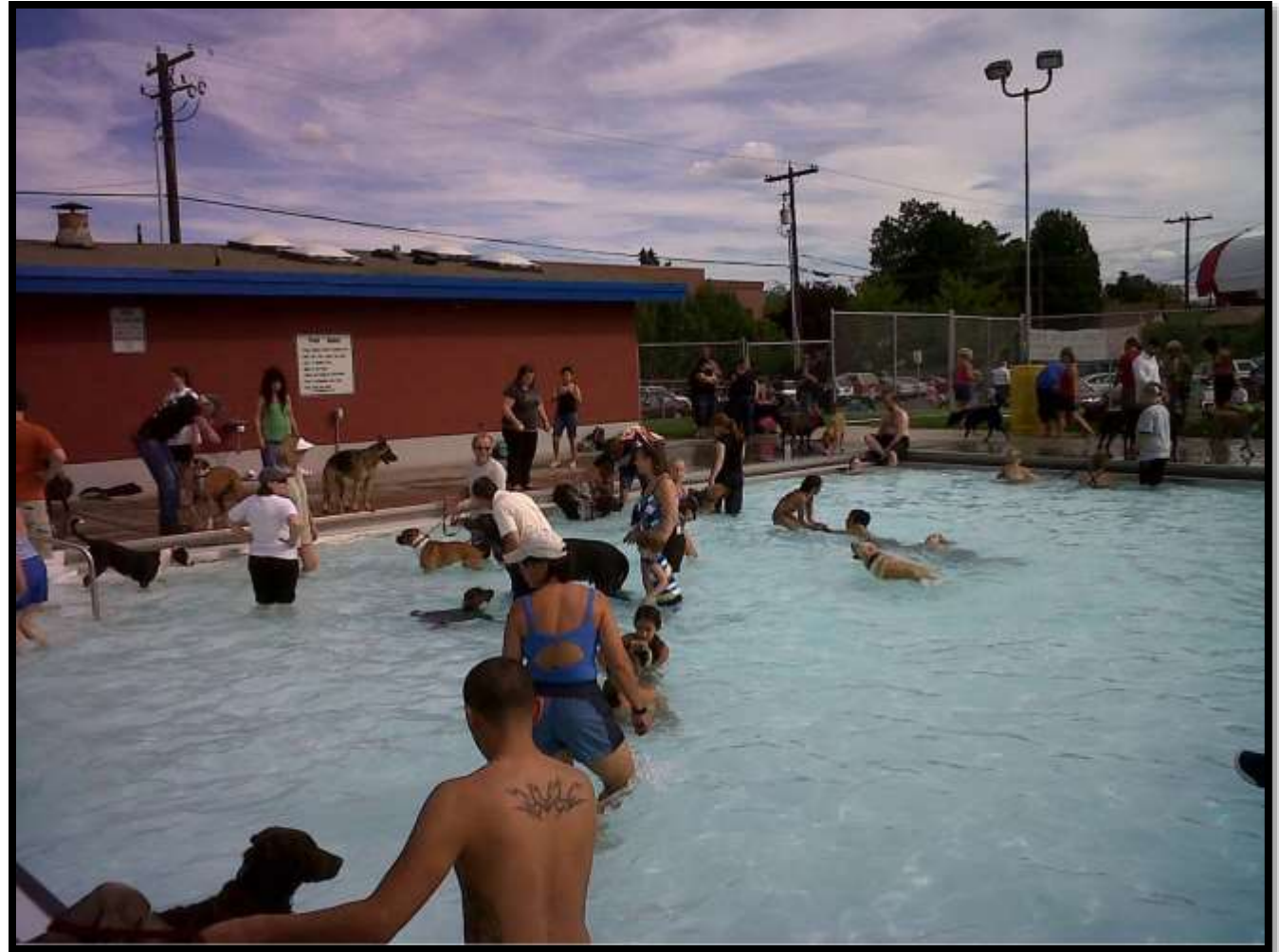
Annual Paws In The Pool Event