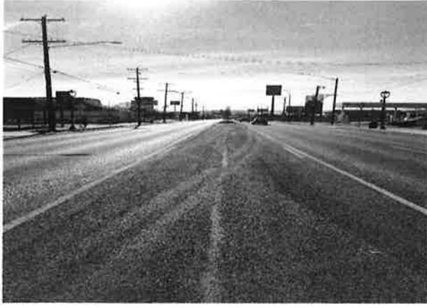
Widening of travel lanes