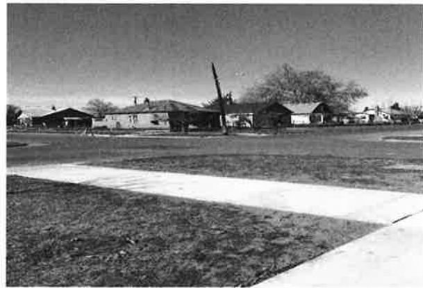
Completed sidewalks with ADA ramps on 4 th St.