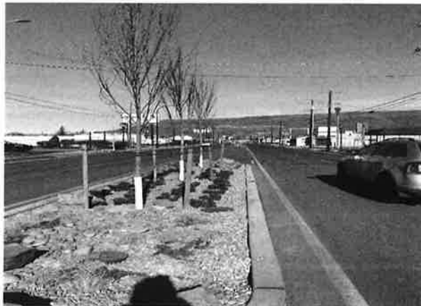
Island with landscaping