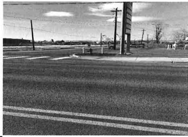
New sidewalks with ADA ramps