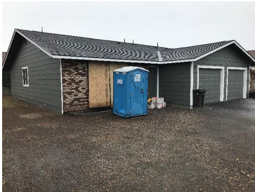
Repairs in Progress