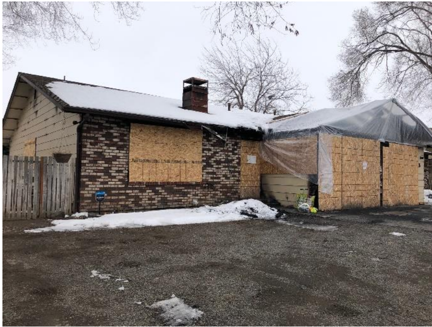
Fire Damaged Structure