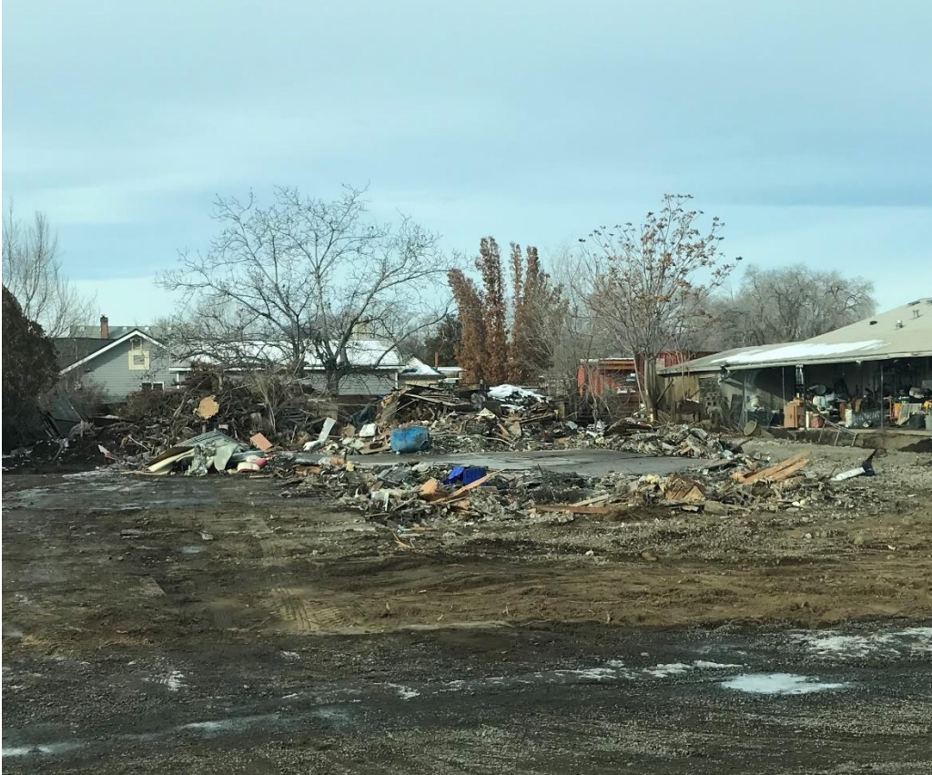
Debris from Demolition