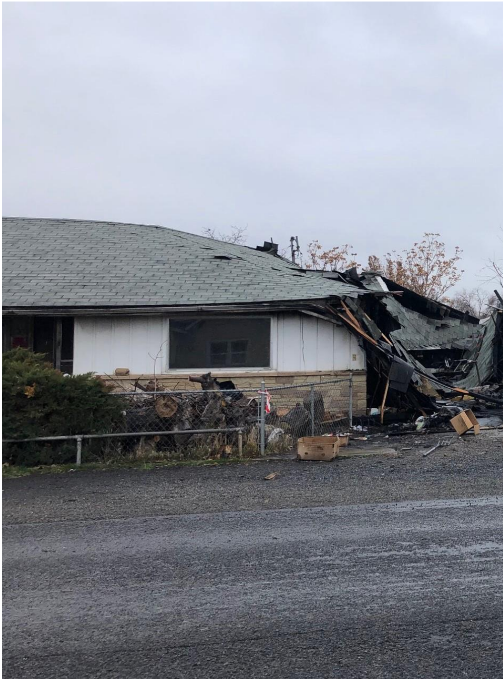
Fire Damaged Structure