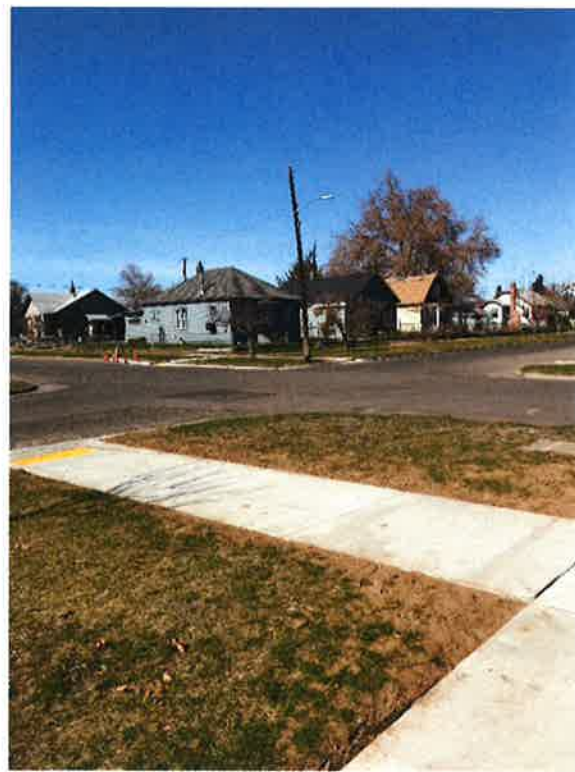
Completed sidewalks with ADA ramps on 4 th St.