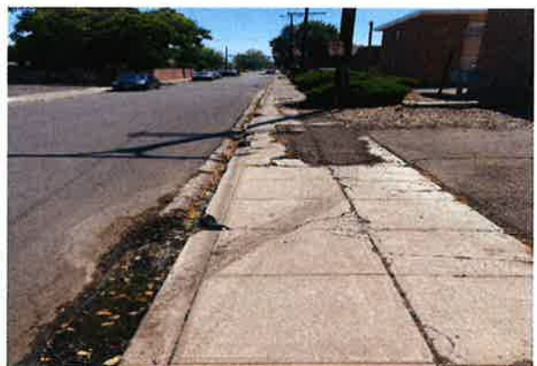
Deteriorated sidewalks along Browne Ave.